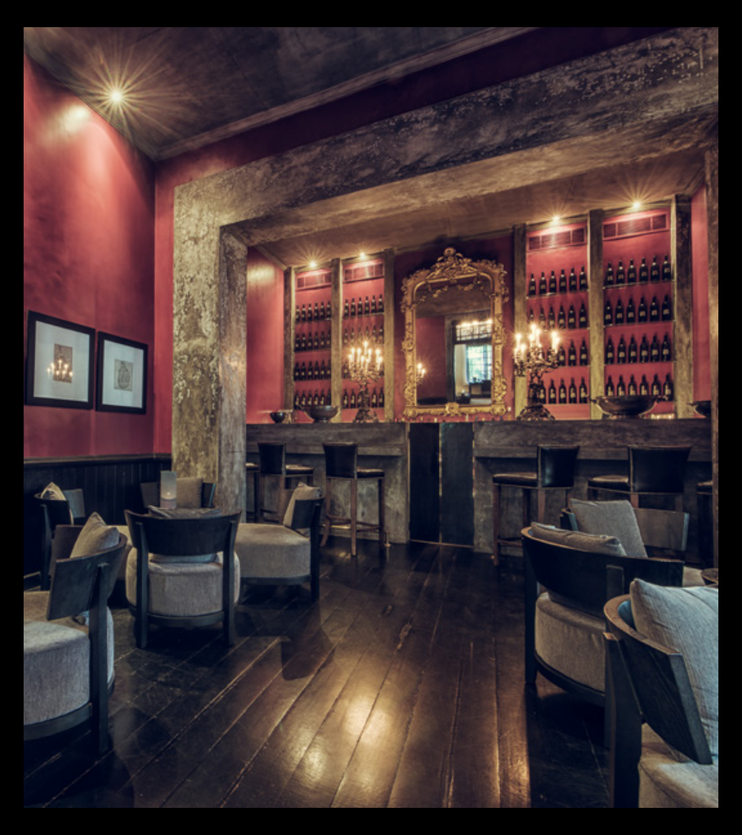
THE RED BAR

The Red Bar takes its name from its crimson red walls combined with a large French baroque mirror imported from the markets of Toulouse, candelabras and bronze tables. The stunning bar offers guests a great place to relax and enjoy signature cocktails, a private meeting, romantic tête-a-tête or unaccompanied me-time. Light menus of bar snacks and evening canapés are on offer throughout the day, along with the brand's time-honored classic cocktails and fine spirits.